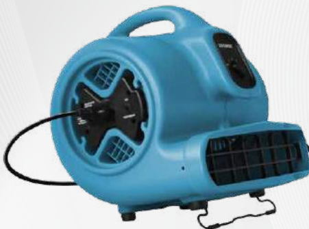
600 Series 1/5 HP - 1/2 HP 1,050 CFM - 2,800 CFM