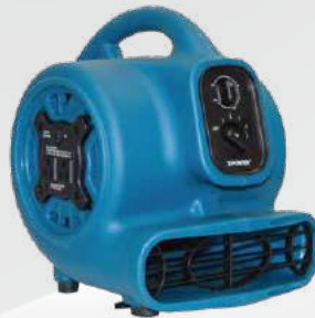
200 Series 1/8 HP - 1/5 HP 600 CFM - 800 CFM