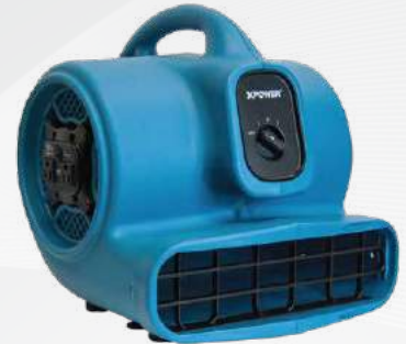
400 Series 1/4 HP - 1/3 HP 1600 CFM - 2000 CFM