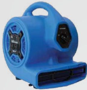
100 Series 1/8 HP - 1/5 HP 500 CFM - 700 CFM