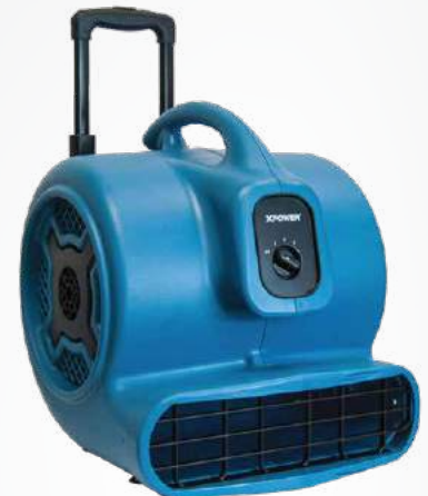
800 Series 3/4 HP - 1 HP 3,200 CFM - 3,600 CFM