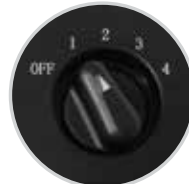
4 Speed Control Switch