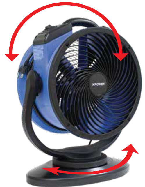
145° Tilt Position & 56° Oscillating