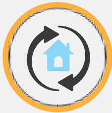
Whole Room Circulation