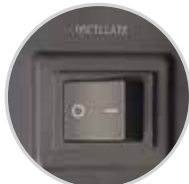
Oscillation On/Off Switch

Specially Designed Air Fin for More Focused Airflow